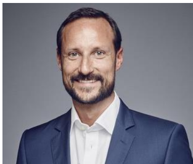
H.R.H. Crown Prince Haakon of Norway