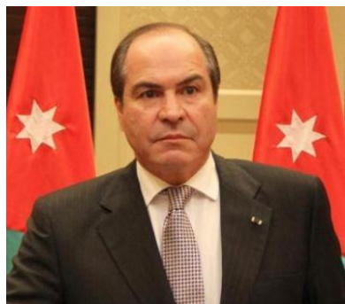
H.E. the Prime Minister of Jordan Dr. Hani al Mulqi