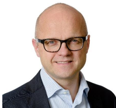
Mr. Vidar Helgesen Norwegian Minister of Climate and Environment